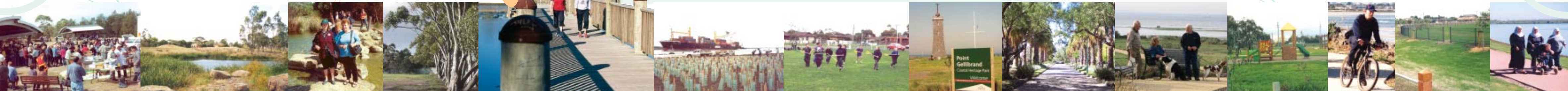
Newport Lakes McCormack Park Newport Lakes Paisley Park Laverton Creek Bridge The Spit Laverton Park Oval Timeball Tower Williamstown Botanic Gardens Doug Grant Reserve Craig Street Park Altona Foreshore Altona Green Cherry Lake