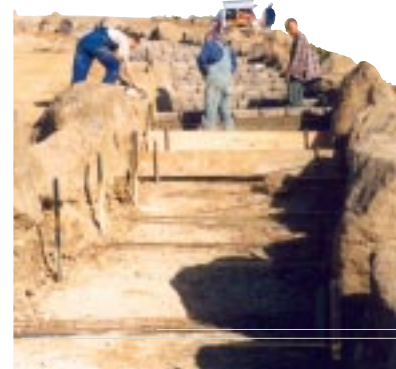
100 Steps under construction

Work together to improve our shared environment