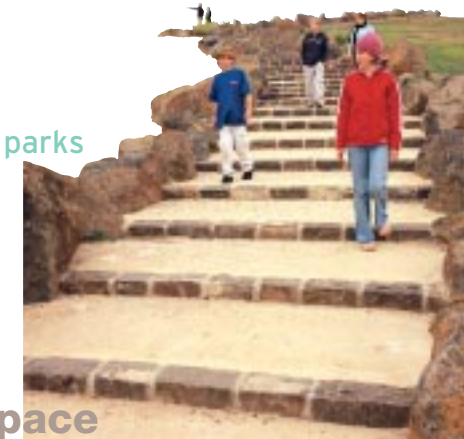
100 Steps Truganina Park